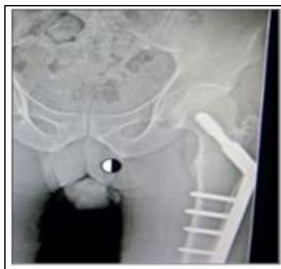
Figure 3: Follow up X-ray of the same cases at 18th month follow up. Complete radiological union of the fracture noted.