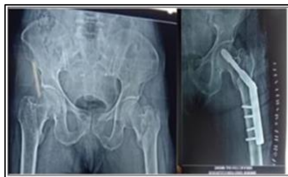
Figure 2: Preoperative x ray showing a type 1 intertrochanteric fracture. Alongside is the immediate postoperative X ray showing satisfactory reduction.